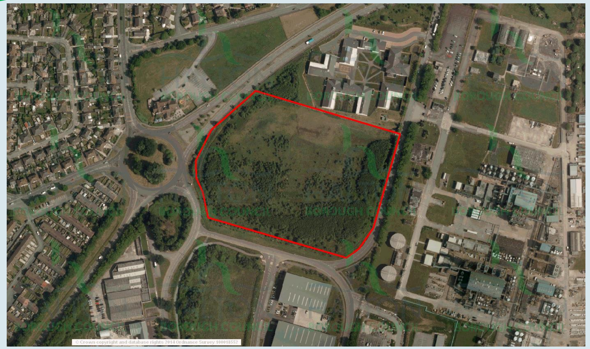
Application Number: 13/00379/OUT